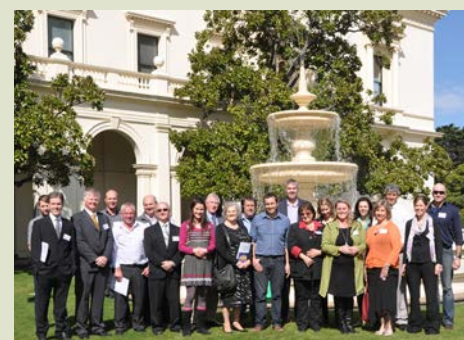
Wimmera Landcare representatives at the 2013 Victorian State Landcare Awards