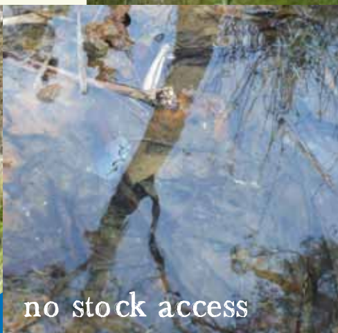
no stock access

Water quality can improve if stock are excluded from the creek line.