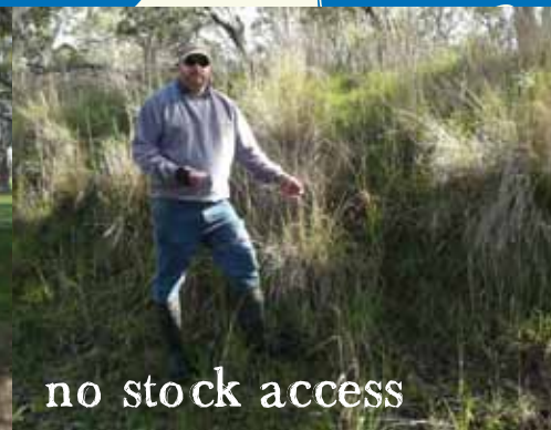
no stock access