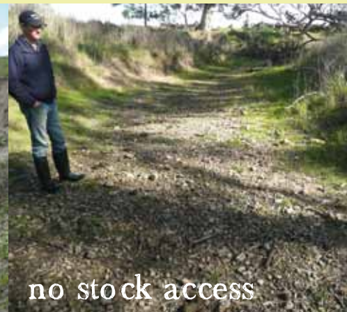
no stock access