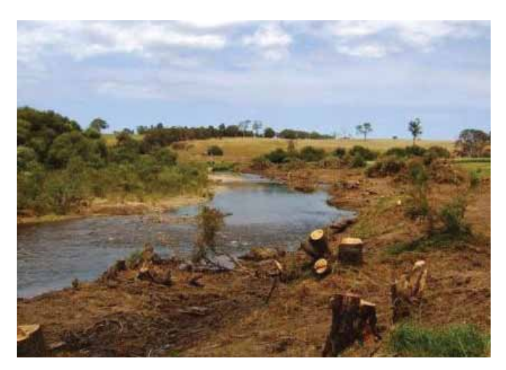
Willow removal on the Mitchell River. After removal, the site was fenced to prevent stock access and revegetated with native plants.

Landholders are currently required to manage certain weeds (and pest animals), under the Catchment and Land Protection Act 1994 for private riparian land and through licence conditions for Crown frontages.