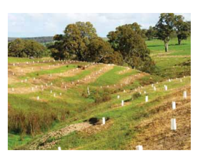
There are many benefits from replanting vegetation on riparian land. On a tributary of the Glenelg River.