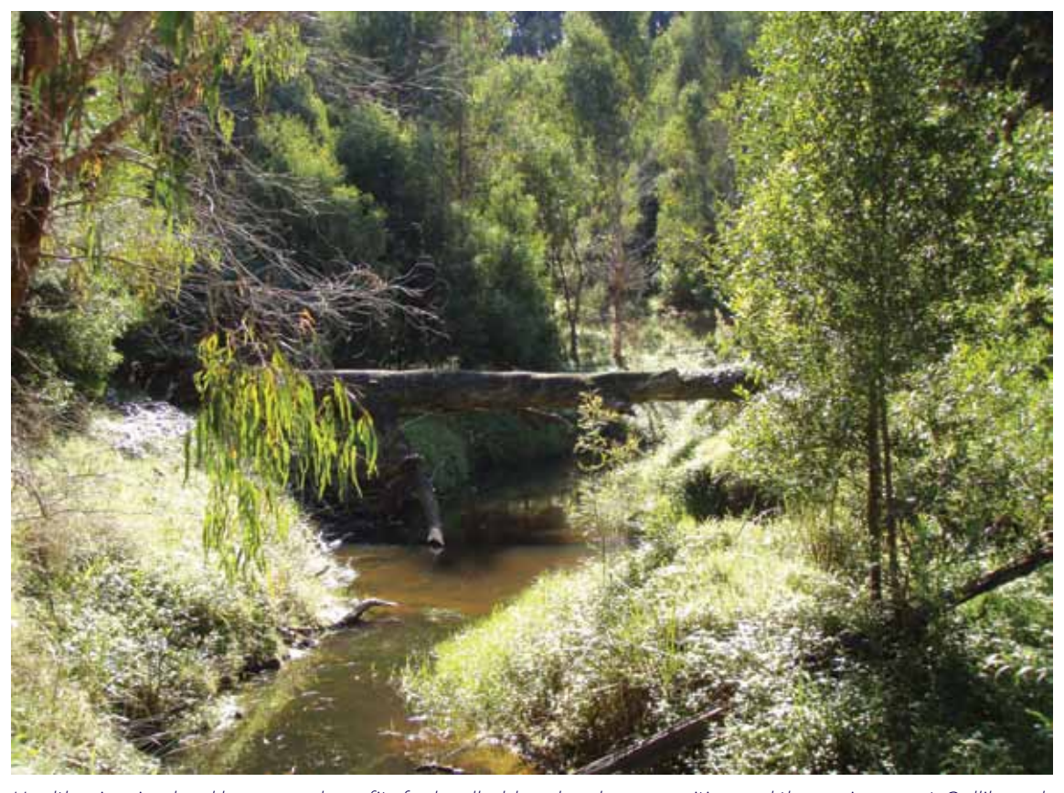
Healthy riparian land has many benefits for landholders, local communities and the environment. Gellibrand River.

More information about riparian land and its management in Victoria is available on <u>DELWP's</u> <u>riparian land</u> web pages.