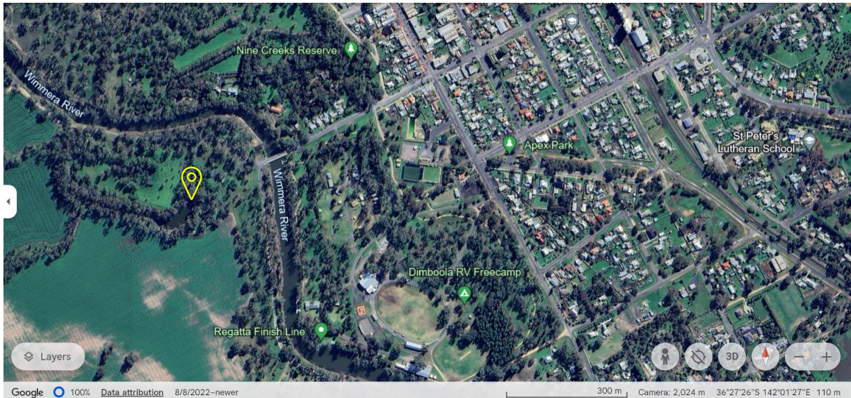
Figure 2. Aerial photograph showing the location of Ranch Billabong.