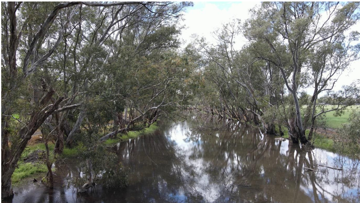
Figure 1. Ranch Billabong, Dimboola

To the west of Dimboola lies the Ranch Billabong, a small body of water, now connected to the Wimmera River with a pipeline. This is a significant site for the Wotjobaluk Nations peoples and is managed by the Barengi Gadjin Land Council (BGLC).