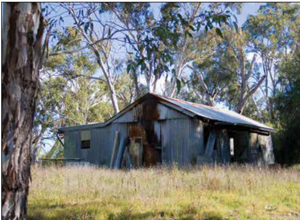
Figure 5. The Ranch.

When the mission was still operating but coming to an end, half the population was removed from Ebenezer and placed at Lake Tyres in Gippsland. Then after it closed completely in 1904, some of the group remained living in Antwerp at the reserve and the rest of the people moved in closer to Dimboola and lived around the billabong. Later on, a small tin shack was purpose build for transient community to come and go as the needed. The shack became known as 'The Ranch.' The building still stands and is recognized by the Victorian government as a significant place in the history of the state.